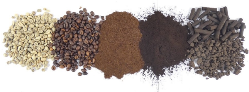
Figure 2. The secondary processing coffee chain with HTC integration - from green coffee beans to coffee char pellets.