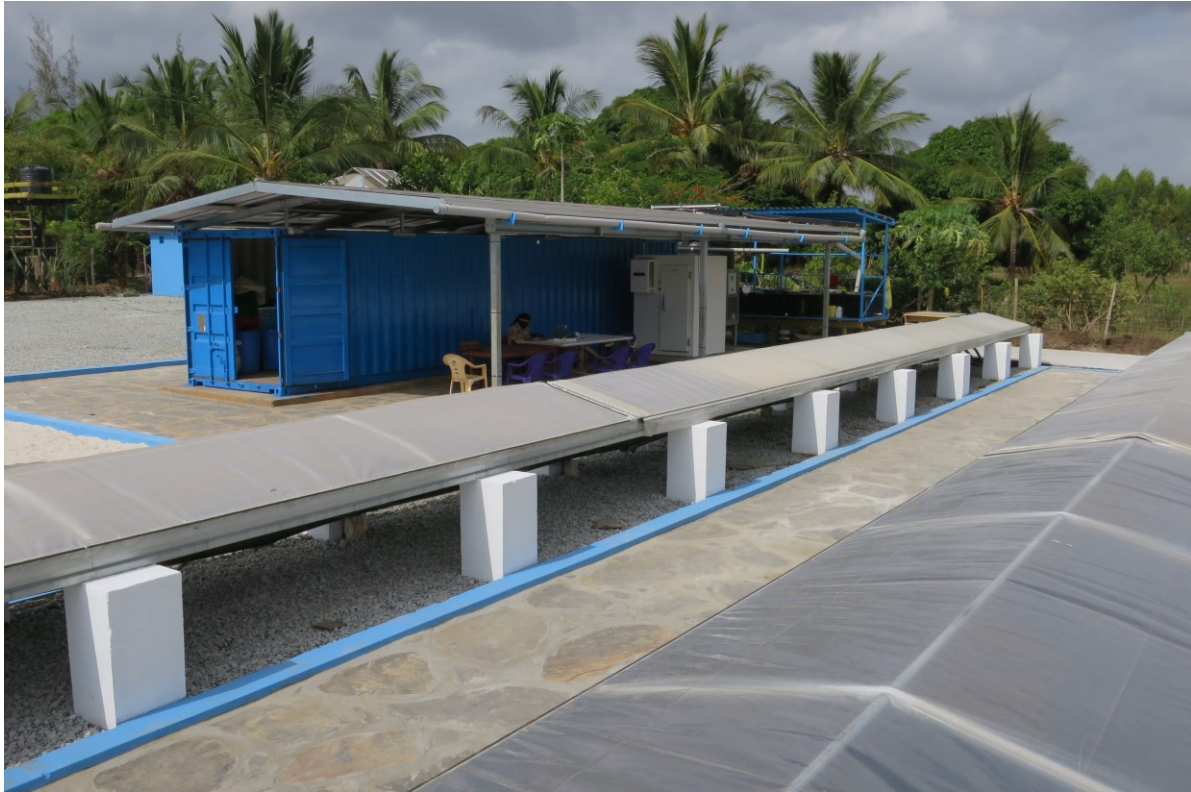
Fig. 4: Completed SolCoolDry system: in the foreground the two solar tunnel dryers and in the background the container with the battery and solar technology, which is shaded by the solar roof. In the shadow on the right side is the ice storage room.