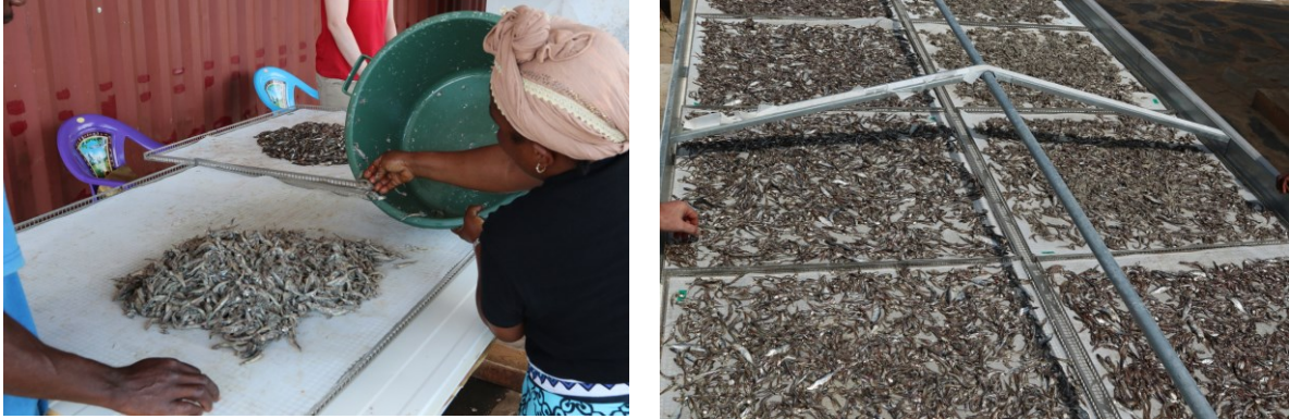
Fig. 6: Preparation (left) and drying (right) of Kimarawali