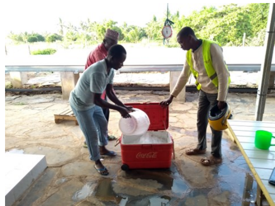
Fig. 5: Ice storage room and ice machine behind it (left), ice dealer collecting ice (right)