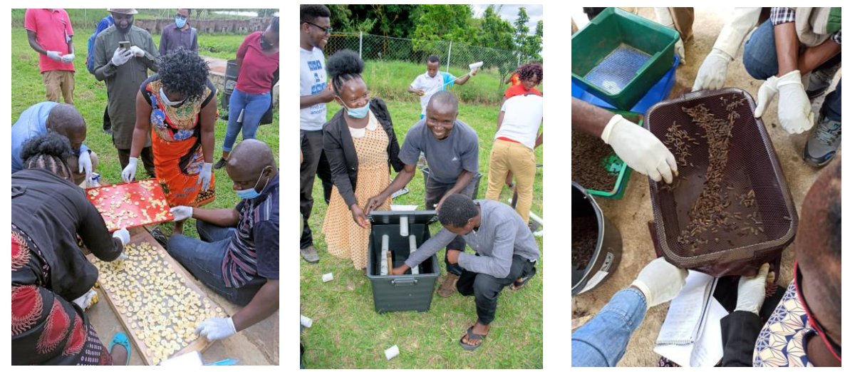
From left to right: As a solar dryer is also suitable for drying fruit and vegetables to achieve shelf life, this application was also demonstrated in the workshop, here with banana slices and mangoes. In the BSF workshop, the participants had the opportunity to build a "Biopod", a starter kit for BSF cultivation. Participants were able to take the "biopod" with them and use it to gain initial experience of BSF breeding in their communities. Among other things, the participants learned to identify the stages of BSF larvae. This is important because certain stages are optimal to be mixed into the fish feed.