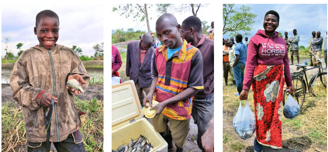
From left to right: Fish harvest in a partner community in Mchinji District (Chikondi Fish Club). A boy is happy about a fish he caught while fishing in the drainage ditch. The treasurer of the fish club counts his income from the fish sale. Fresh fish for the villagers.