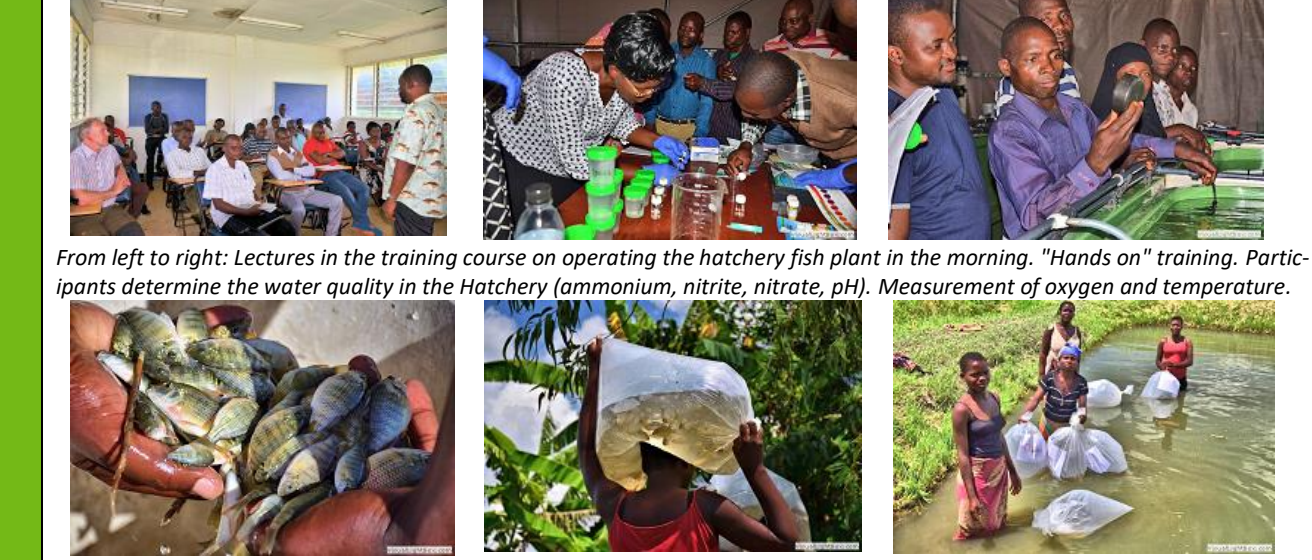
From left to right: Seedlings for the farmers' ponds from Bunda Farm. Transporting the seedlings to the farmers' ponds. Temperature adjustment of the transport bags before release.

The following picture collages are a selection and are intended to give a visual impression of the activities carried out in the project. Almost all of the pictures shown here are available in high resolution and can be shared if desired. Many more pictures are also shown on the project's website (www.fish-for-life.org). Please send enquiries to B. Ueberschär, ueberschaer@gma-buesum.de