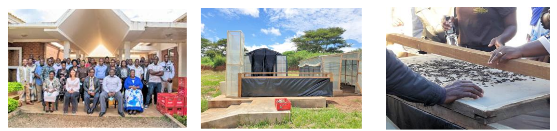
From left to right: Participants in the BSF workshop with some of the supervisors. A solar dryer built by the project is very efficient to dry the BSF larvae. This step is necessary if the larvae are to be further processed. The participants of the workshop test the solar dryer with some BSF larvae.

From left to right: Insectarium with the "love cages" for reproducing the BSF. In the middle, the larvarium in which the boxes with the substrate and the larvae are housed. Larvarium and insectarium have to be separated, as the demands on the environmental conditions for the different life stages are very different. The BSF is widespread in the wild in Malawi, so that it is unproblematic to initially build up a brood stock via wild catches.