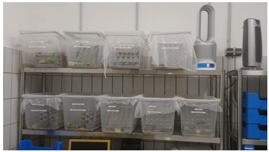
Fig. 5: Cricket rearing in boxes in Germany; picture: Grabowski.