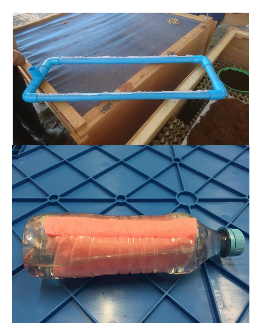
Fig. 7: Solutions for a constant water supply in Thailand (above; picture: Grabowski) and Germany (below; picture: Trögel).