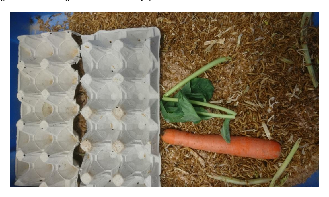
Fig. 6: Mealworm rearing in Germany; picture: Grabowski.