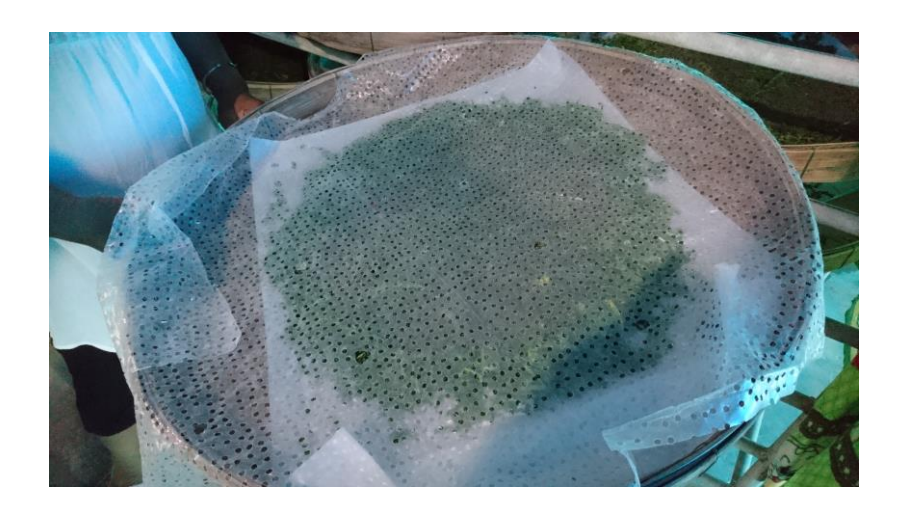
Fig. 3: Traditional silkworm raising on frames in Thailand; picture: Grabowski.