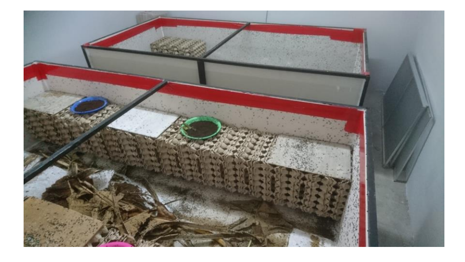
Fig. 4: Cricket rearing containers in Southeast Asia (Thailand); picture: Grabowski.