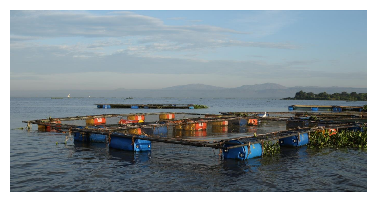
Fig. 2: Fish farming in Lake Victoria near Kisumu