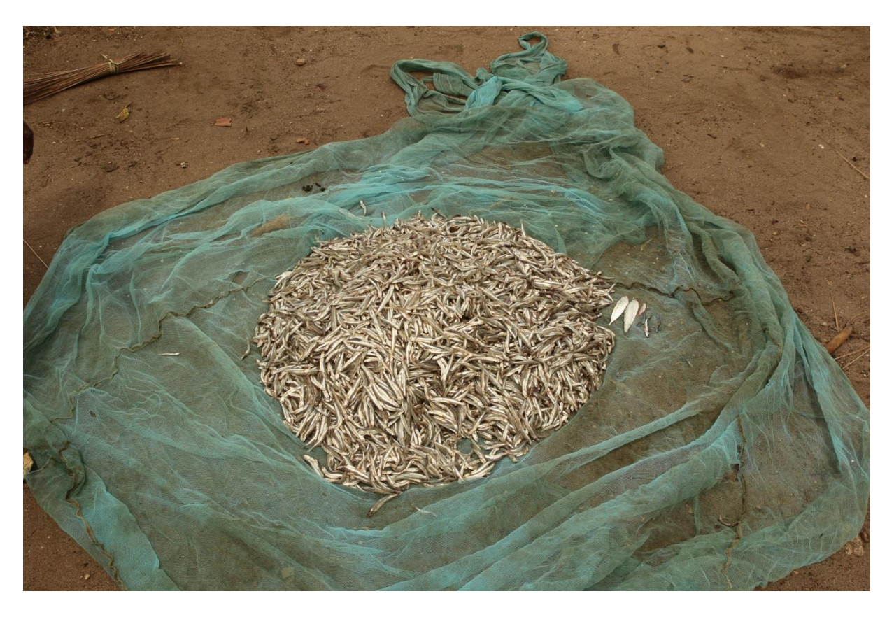
Fig. 4: Fish, cooked in salty water before drying, near Vanga