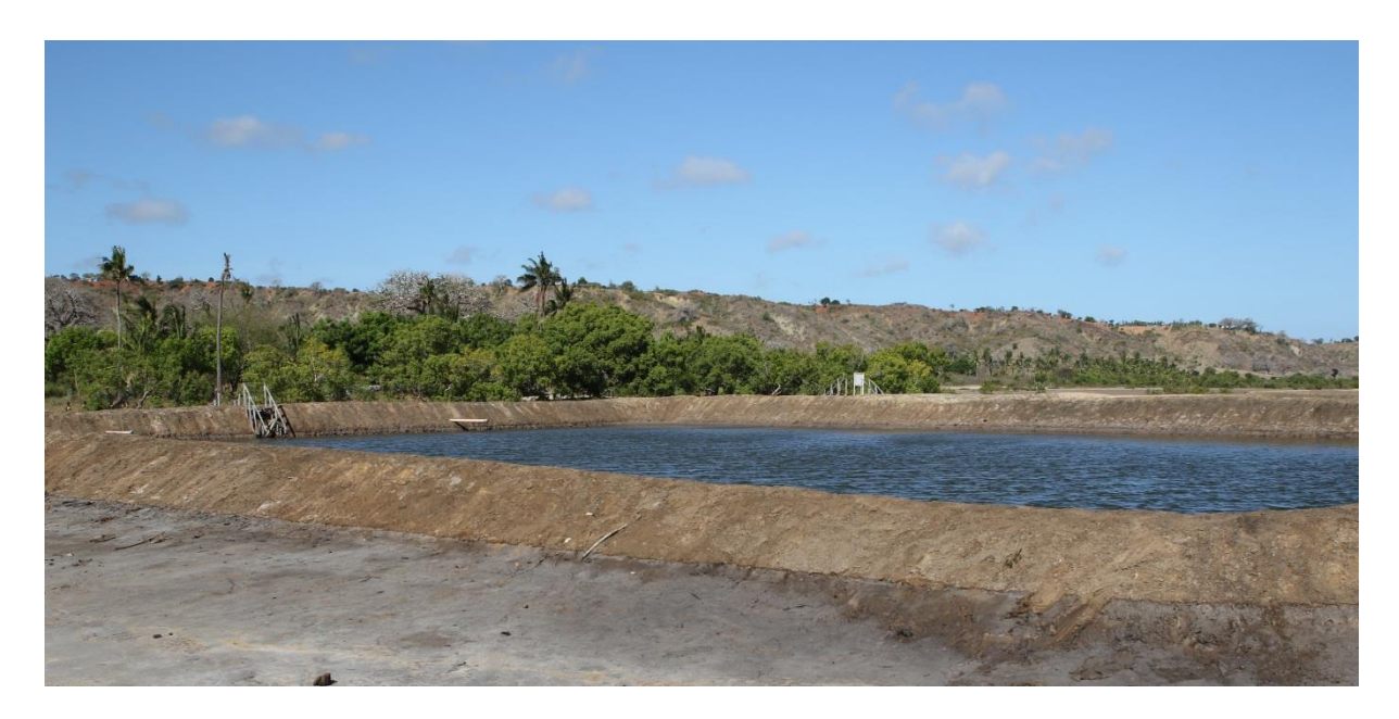
Fig. 3: Fish pond, influenced by the tides, near Kilifi