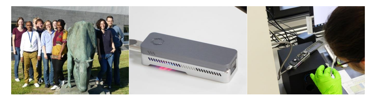
Figure 1 Impressions from the training stay of the African PhD students at FLI. Left: Group picture. Middle: MinION. Right: Student loading samples onto the MinION device.

The year 2018 started with a 7-week training of our African PhD students in molecular biology and cutting-edge sequencing techniques at the Friedrich-Loeffler-Institut in Germany ( Figure 1 ). Aim was to teach the students in the most important molecular methods for later implementation in their laboratories in West Africa. Besides laboratory standard techniques special focus was put on the training with a novel sequencing device, the so-called MinION, which has in the recent years greatly improved sequencing abilities during disease outbreaks under field conditions due to its small size ( Figure 1 ).