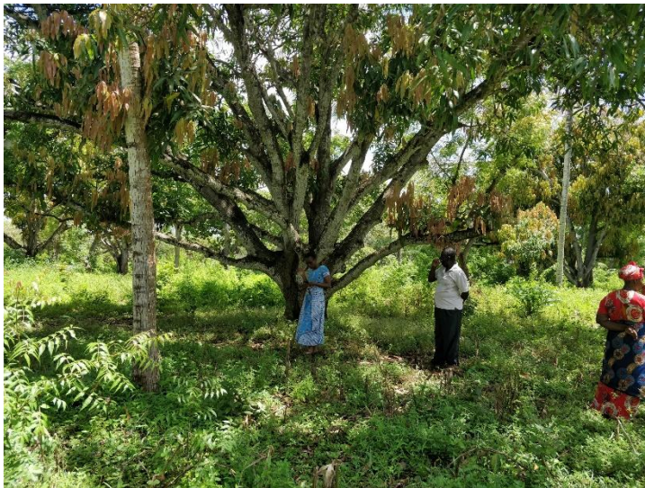
Figure 3: WP2 activity: selection of fruit trees (here a mango trees) suitable for field trials of the PhD student on farmers' fields in Kilifi area, Kenya.