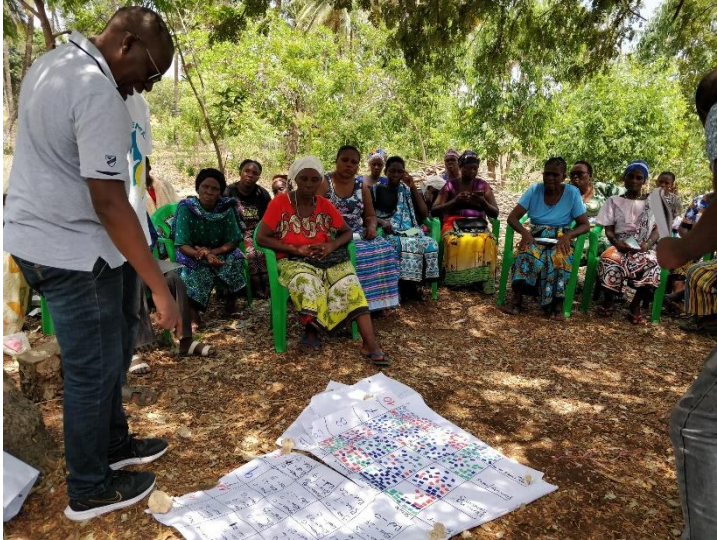
Figure 2: WP1 activity: focus group discussion for the mango hotspot analysis with the Kayanda FFS group in Takaungu, Kenya.