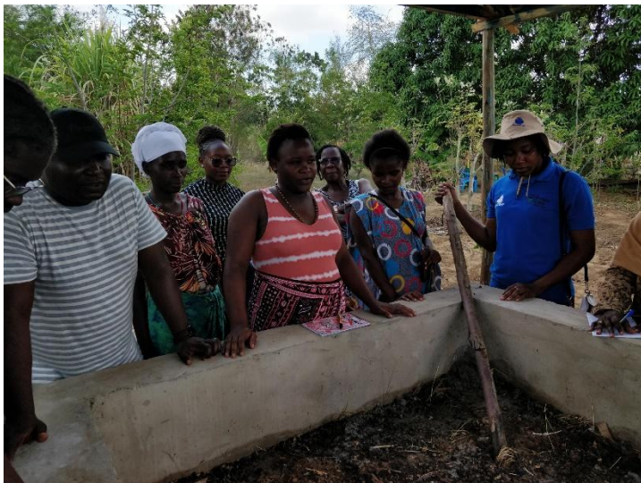
Figure 4: WP3 activity: Members of the Saidia Young Mothers FFS group in Mavueni, Kenya, together with their facilitator from the NGO Plant Village (in the blue shirt) show their new compost shed provided by the project and explain the process of compost making, on which they received training.